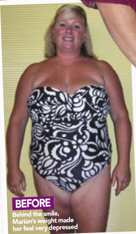
She is now delighted with the results of her 'mental' gastric band

She explained that the treatment would involve five hypnotherapy sessions where she'd